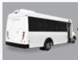
Dark tint panoramic windows