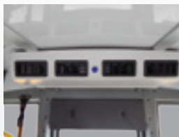
Up to 82K BTU A/C