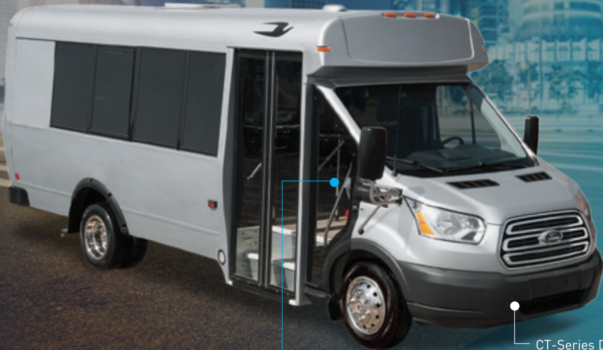
CT-Series DLX DIESEL